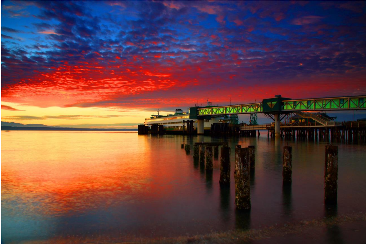
Sunset Edmonds Beach with Ferry at Dock